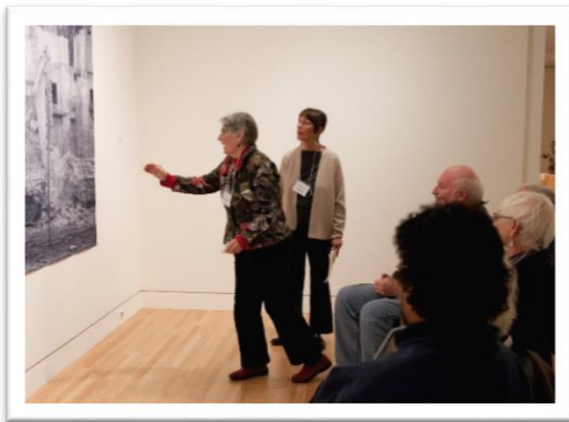
Frye Art Museum here:now program.